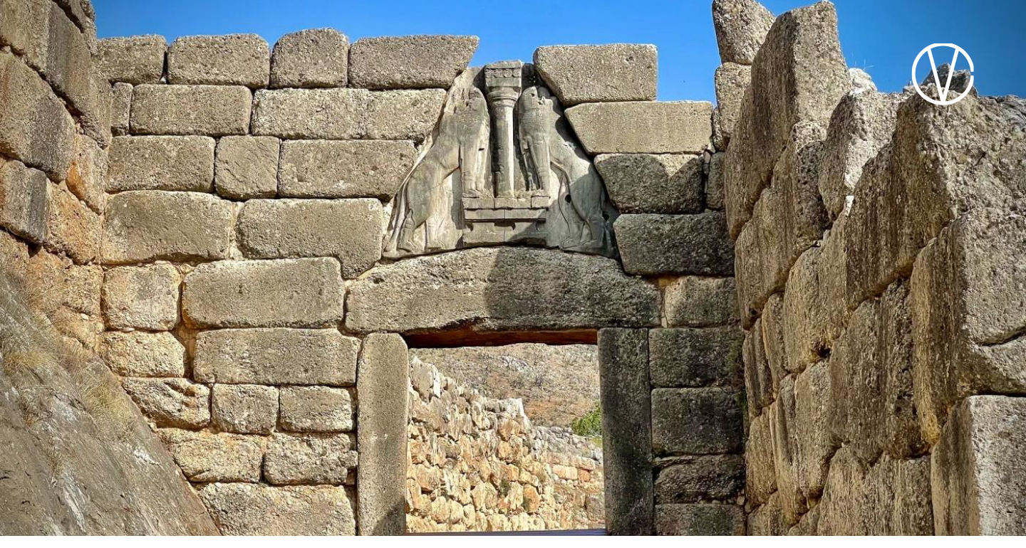
DAY 3 NAFPLION — MYCENAE